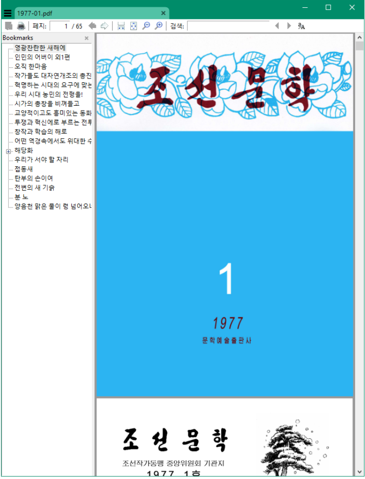
KLMviewer.exe with open document

The interesting part was that the reader seemed to include all of those PDF files, actually several hundred documents. But the reader was just ~6 MB large. One interesting piece of information from the initial screenshot of the WinMain() checks was that it referenced a "data" directory which was not on the ISO when I mounted it. It turns out that the directory was just hidden and my mount refused to make them visible. In order to make the directory visible you have to mount the ISO with the "unhide" option: